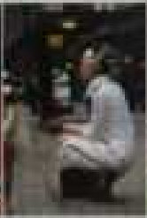
Digital Couture: womenwear