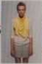
WGSN Preview: EMM, Madrid