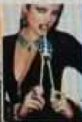
A/W 12/13 footwear & accessories: all