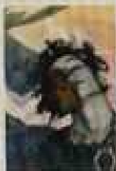
A/W 12/13 men's casualwear Hypocrite