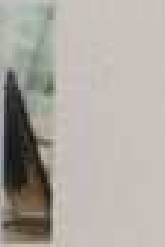
Look with: China