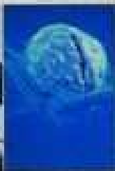
Digital bodies: technology find