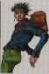
Manga artist Hiroshi Araki collaborates with